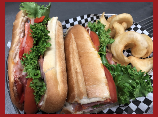
Brando's Italian Grinder