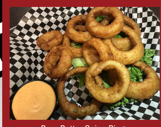
Beer Batter Onion Rings