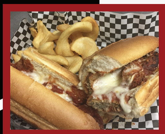
Marilyn's Meatball Grinder