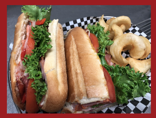
Brando's Italian Grinder