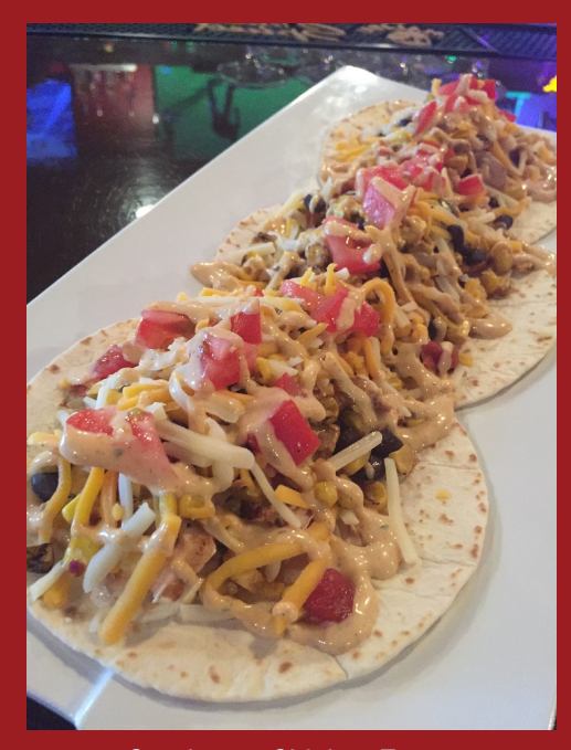
Southwest Chicken Tacos