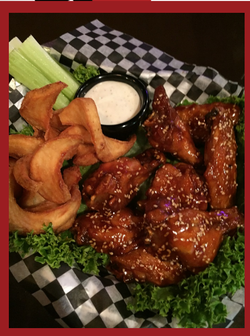
Teriyaki Wings w/ Sidewinders