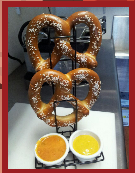
Twist & Shout Pretzel