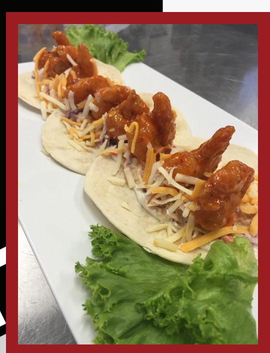
"Ring of Fire" Shrimp Tacos