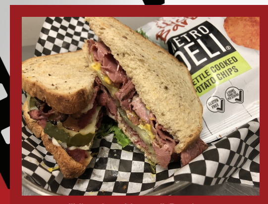
"Viva Las Vegas" Reuben