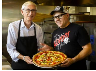
July 29, 2021