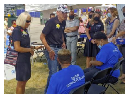
Wisconsin State Fair; Published August 6, 2021