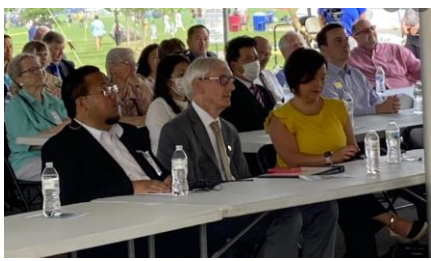
July 31, 2021