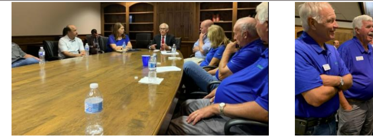
Wisconsin Department of Financial Institutions; July 27, 2021