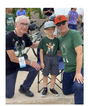
July 22, 2021