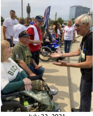
July 22, 2021