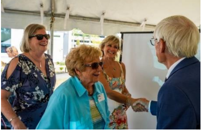
August 4, 2021