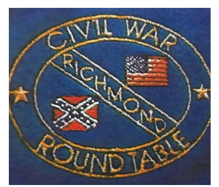
Founded on February 8, 1951