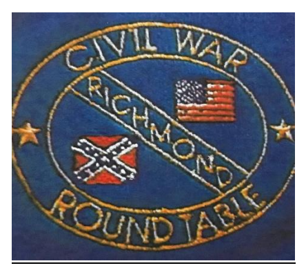
Founded on February 8, 1951