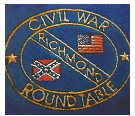
Founded on February 8, 1951