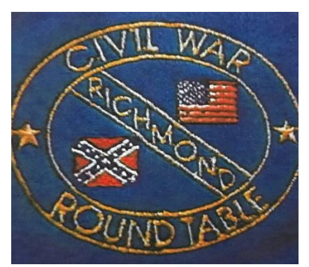
Founded on February 8, 1951