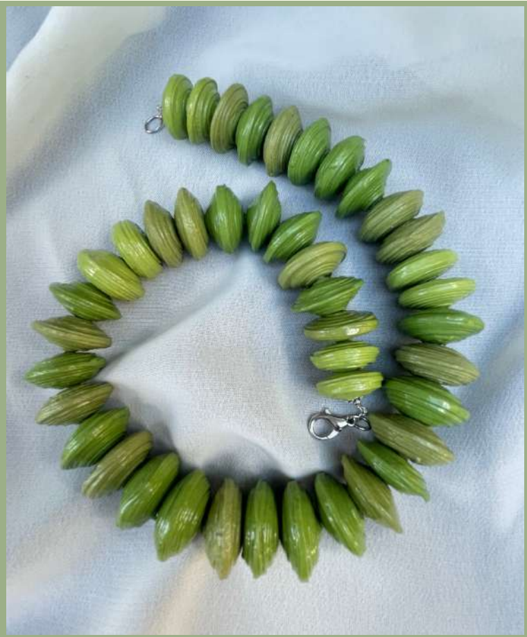
Single harmony in sage green Code: SH42BSG