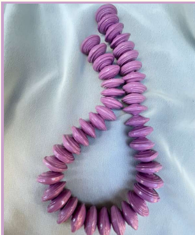
Single harmony in lavender Code: SH42BLA