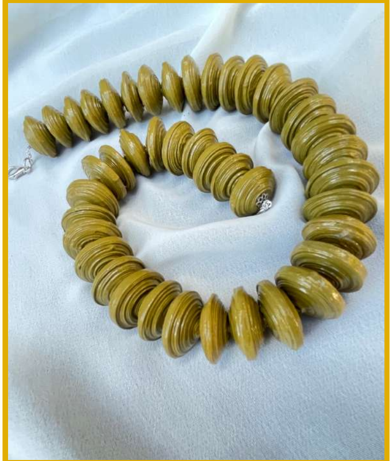
Single harmony in mustard olive Code: SH42BMO