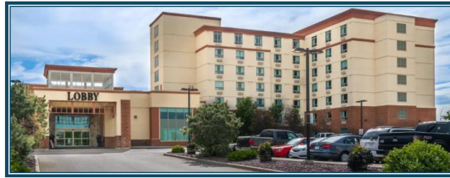
Deerfoot Inn & Casino - Hotel and Conference Centre Entrance

The Deerfoot Inn & Casino Hotel has once again offered the Military Collectors Club of Canada and Calgary Militaria Shows a discounted event group rate. Participants and attendees can book either a Traditional King or Traditional Two Queen Room both at $159.00 per night, the same rate as last year.