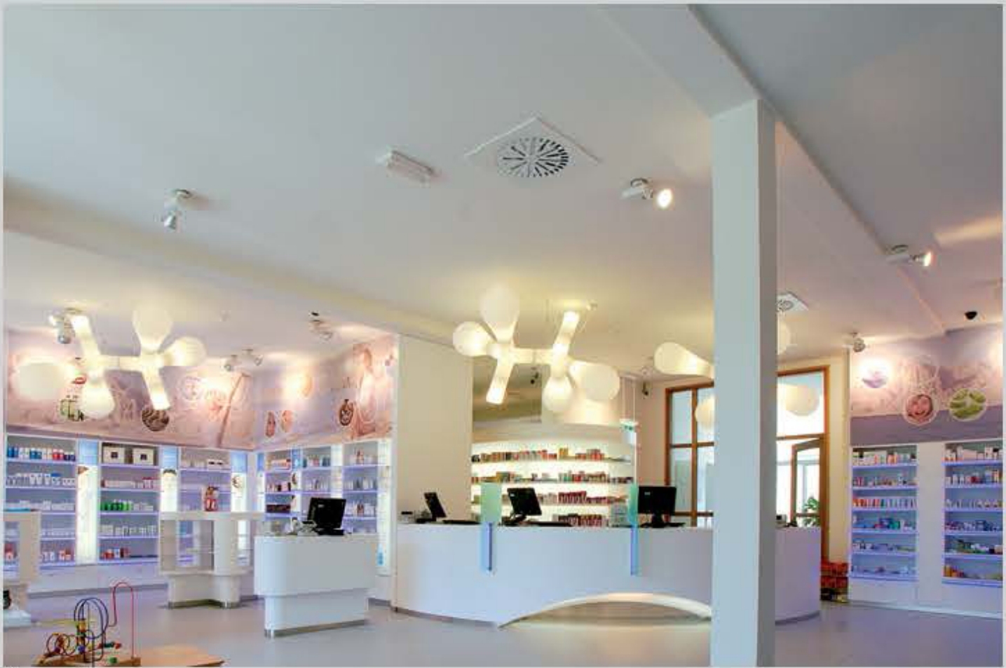
Pharmacy - Germany