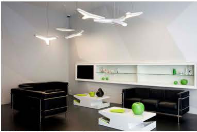
Medical office - Belgium - Installer: MonaVisa