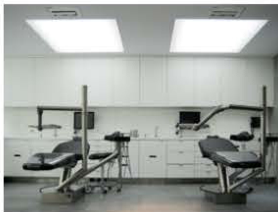
Kelderman Orthodontics - Netherlands - Architect ARHK - Installer: PolyGroup