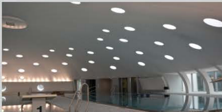
Lingsheim swimming pool - France - Installer: Voltaire, Louis & La Bergere