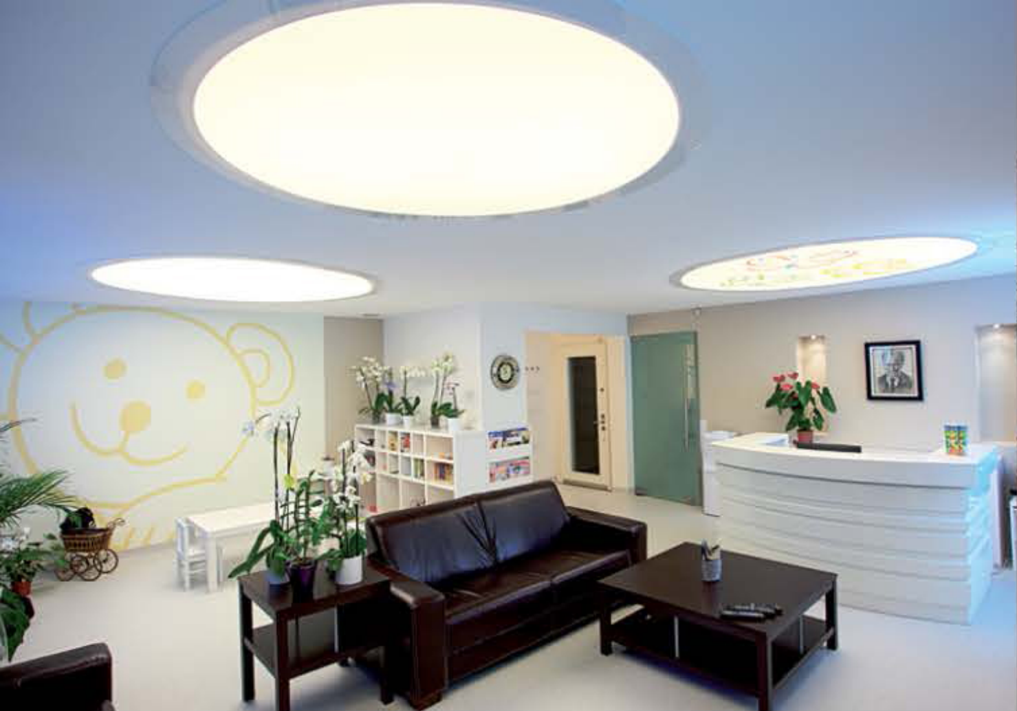
Medical Office - Turkey - Architect: Zeynep Tevar - Installer: TTI Technologies