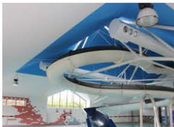
Indoor Water Park - United Kingdom - Distributor: Acoustic GRG