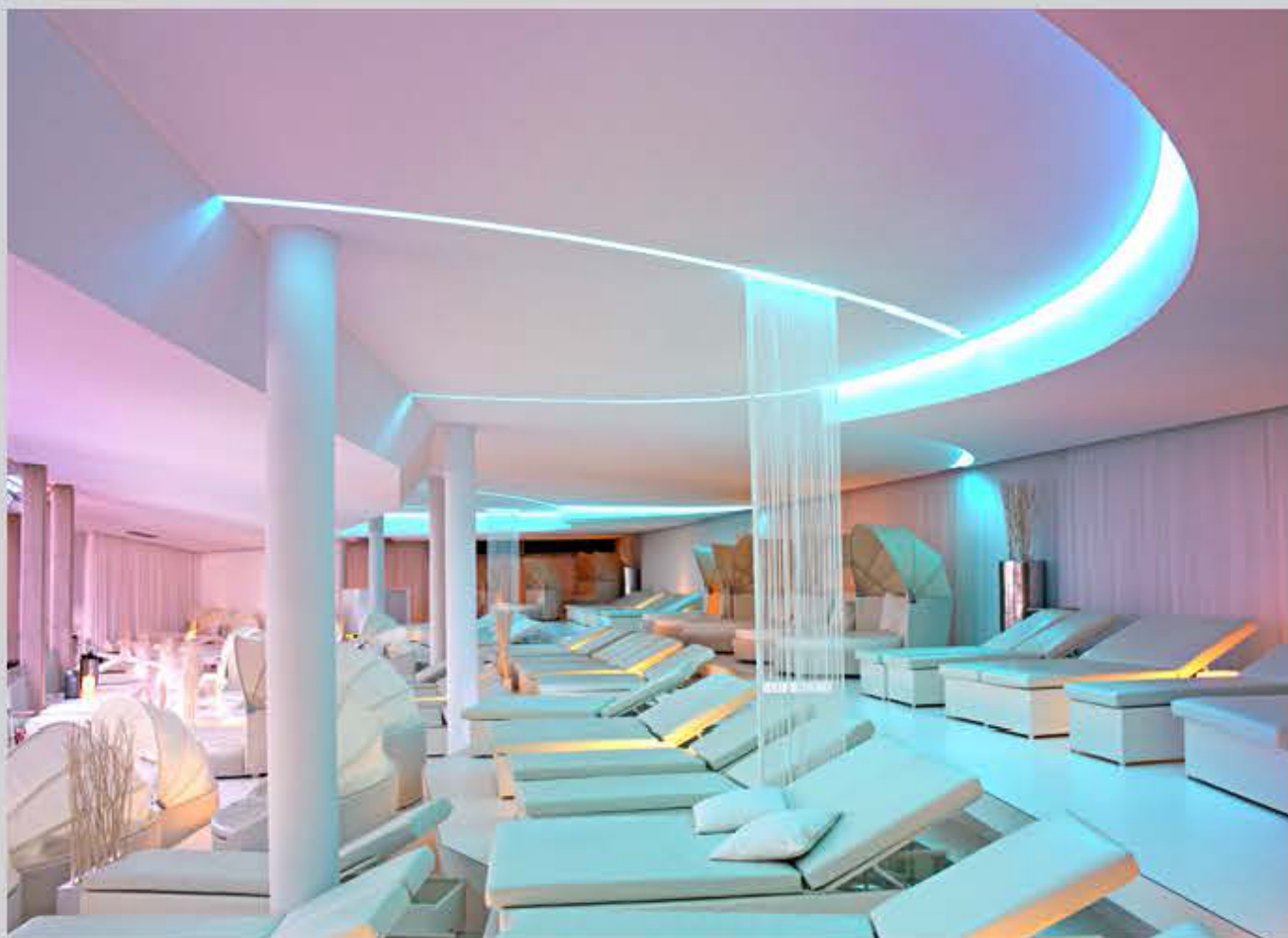
Thermen & Badewelt Spa - Sinsheim, Germany - Architect: Architekturburo Wund - Installer: Art Design Hahn - Distributor: Baumann Spanndecken