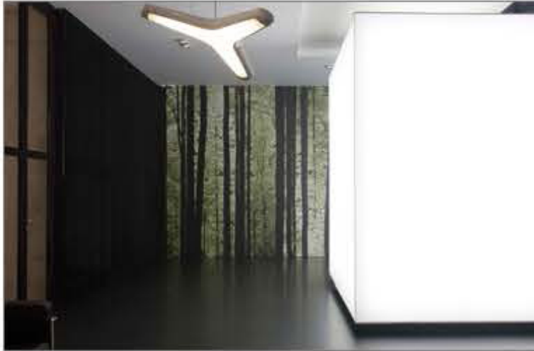
Medical office - Belgium - Installer: MonaVisa