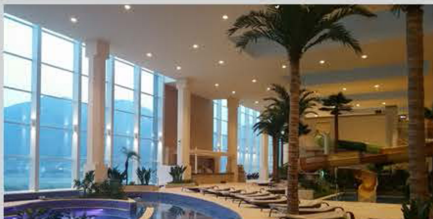
Swimming pool ceiling - Korea - Installer: EFAS