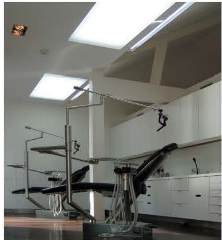
Kelderman Orthodontics - Netherlands - Architect: ARHK - Installer: PolyGroup