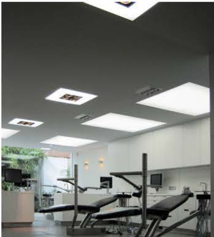
Kelderman Orthodontics - Netherlands - Architect: ARHK - Installer: PolyGroup