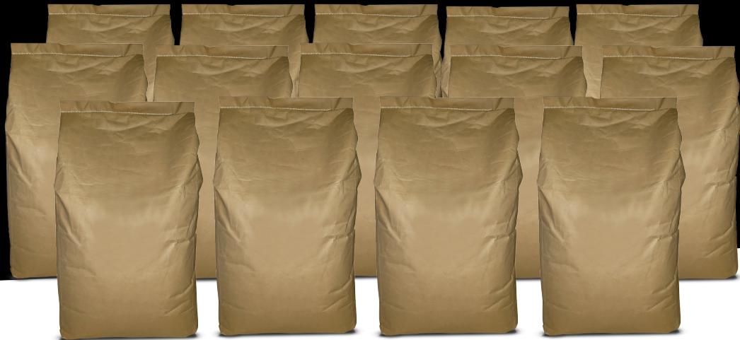
Fourteen 10lb. Bags of Clay Product