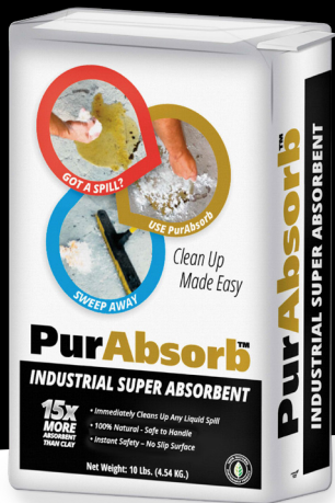
One 10lb. Bag