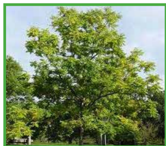
Espresso Kentucky Coffeetree Gymnocladus dioicus 'Espresso'