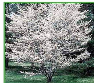
Rainbow Pillar Serviceberry Amelanchier arborea 'Glenn's Upright'