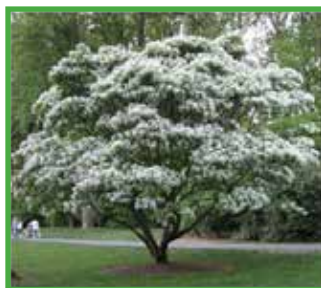
White Fringetree Chionanthus virginicus