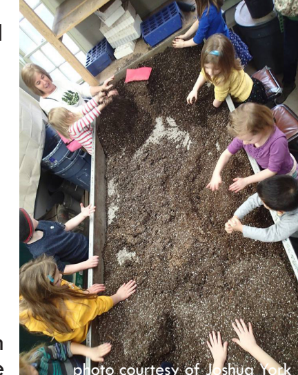
Kids gather for a native seed planting, which will later be planted in Conservation Corner.

talk with their peers about the importance of protecting nature, and vary in topics from creating their own Backyard Bird count, attracting moths to the backyard for a Moth Party Sleepover, searching for spiders, and even leading their own nature hikes for their friends! Kids get tools to help them conduct their parties, and are asked to come back at a later date to share their successes with other kids getting ready to conduct parties themselves.