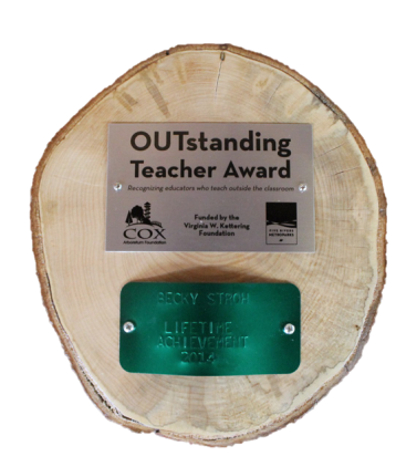
Special thanks to the Woodworker Volunteer Group for creating the award plaques!