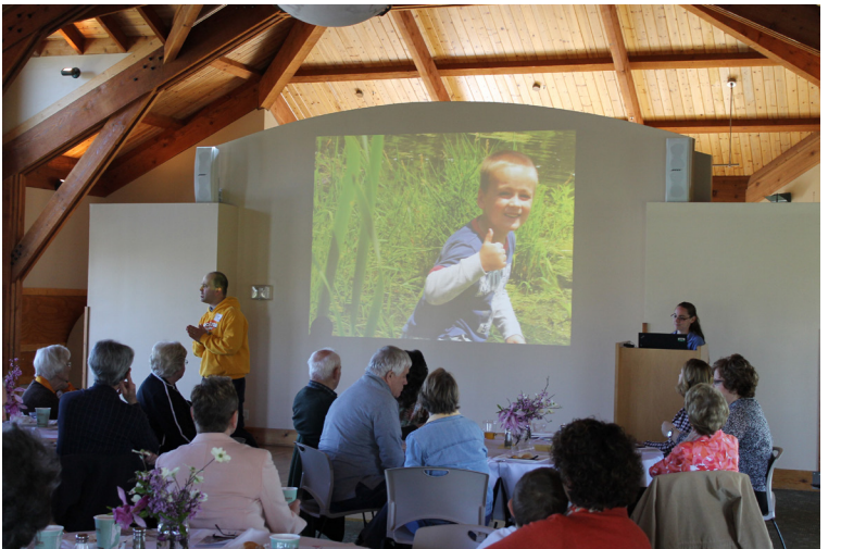
Five Rivers MetroParks Conservation and Nature staff share with members program opportunities available to children and adults.