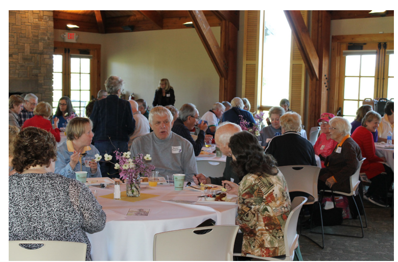
Foundation members enjoy a breakfast buffet and catching up with friends before the presentation.