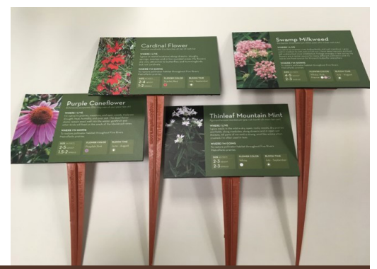
Native Plant Labels

To educate visitors with self-guided and guided tours of the BCCSH, the Five Rivers MetroParks education department has developed an interpretation plan for the BCCSH. The interpretation will create an educational experience by highlighting native plant propagation and creating an inviting visitor experience from the entry of the BCCSH, at the Resource Center, throughout the greenhouses.