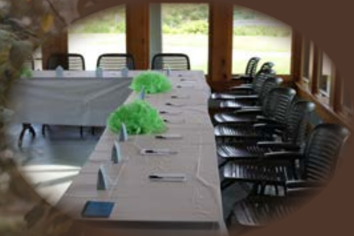
KETTERING LEARNING LAB

Founders Society members receive a 20% discount on venue rentals.