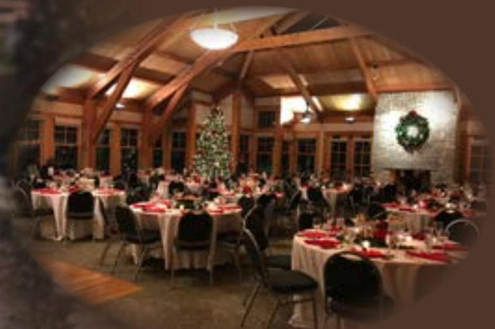
FIFTH THIRD CONFERENCE ROOM