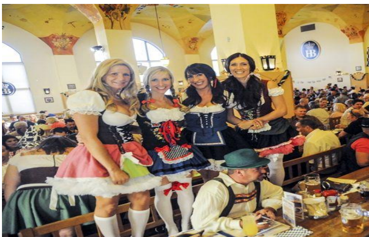
"The Paddle Girls"