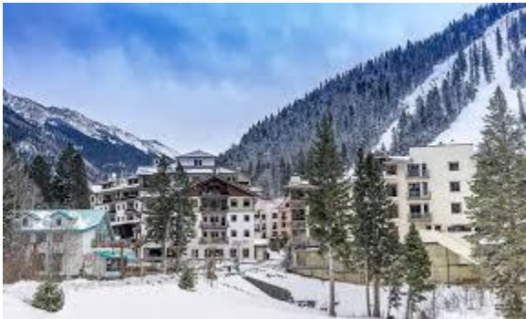
The Blake Taos Ski Valley https://taosskivalley.com/member/blake/