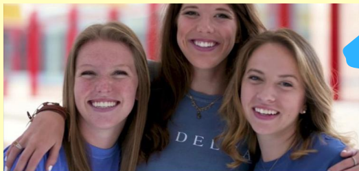
YOUTUBE.COM Bring You! Tri Deltas are one of a kind, but kind alike to...