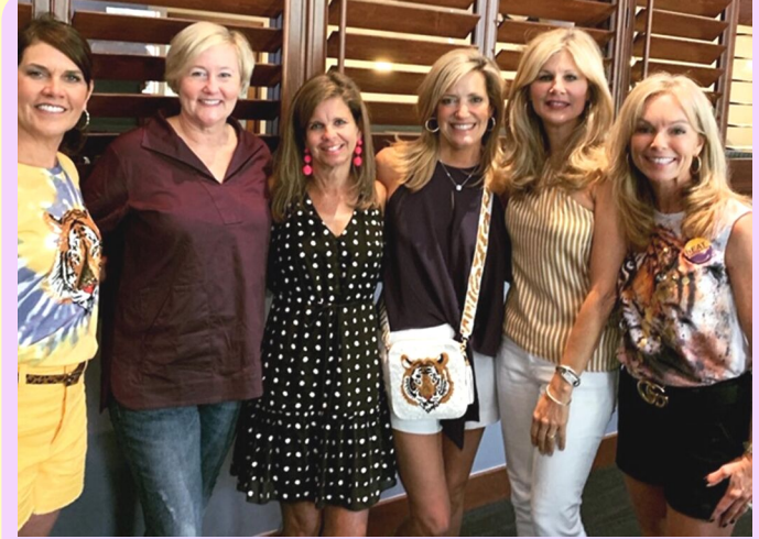
Tri Delta Alums spotted in Austin to cheer on the TIGERS