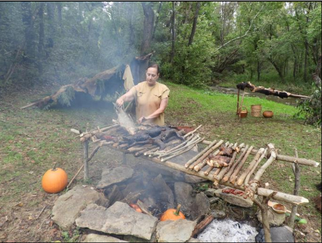
How far back in time do you want to anchor your timeline? Paleo, Middle Archaic, or perhaps Late Woodland, like these living history interpreters demonstrating Monongahela Tradition fishing and cooking in 2018 during the Greene County, PA Historical Society's Stone to Steel event?