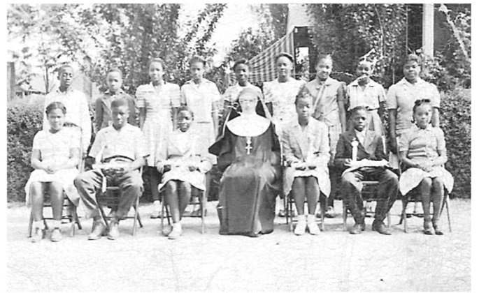
CONFIRMATION CLASS: Sisters of Christian Charity with confirmation candidates in 1954.