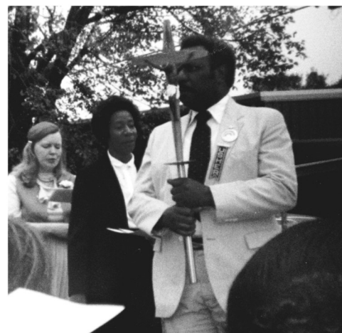
MINISTRIES FORMED: Ushers group along with other ministries are established in 1987.

One of the encouragements towards developing all these ministries was the realization that a new church would soon be completed for St. Augustine's. The parish not only wanted to grow in the size of its building, but also wanted to grow in its spirit and in number. Therefore, the laity as well as the religious and priests who served here were working hard to make St. Augustine Church a fitting home for people to find a strong presence of Jesus Christ.