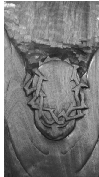
AFRICAN WAY: 14 hand carved panels depicting the Stations of the Cross were created in 1990.