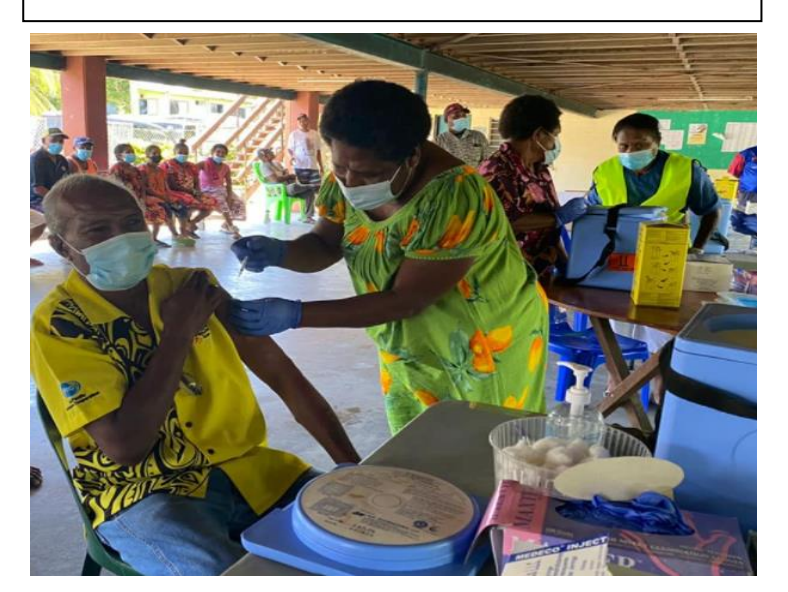
Photo 1: Vaccination drive in Gaire village in Central Province jointly by Central Province PHA and Gaire United Reform Church team.