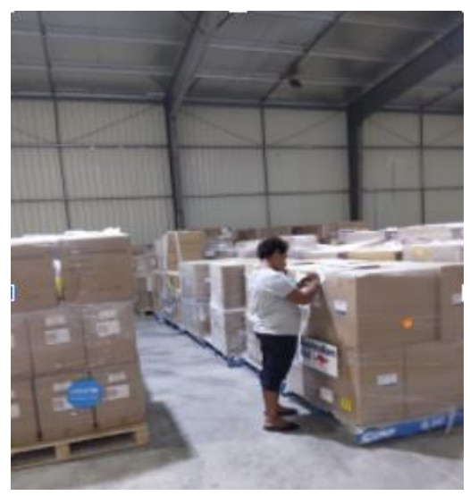
Photo 2: AES Warehouse in full swing. Logistics team hard at work on setting up and stocking the new site.

For more information about this Situation Report, please contact: