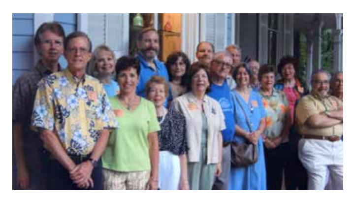
DVPCA members at Wheation Village on a sunny Sunday afternoon

As we prepare for our inaugural meeting, I asked myself, why? Why do we paperweight enthusiasts need a club? The answer was easy. For each of us individually, the club provides an opportunity to meet like-minded people with whom we can share our enthusiasm, our knowledge, and our friendship. In addition, when we form a club, we become part of a new life that is bigger than we are as individual collectors. This larger organization can make a contribution to the art that we could not make alone. As we pursue our club's activities, we will be gathering and disseminating information, we will be introducing the art of paperweights to the uninitiated, we will create a new forum at which artists can present their work, and we will be creating a new marketplace for collectors. In short, we will be contributing to paperweight history