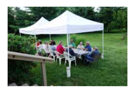
Members enjoying a perfect afternoon