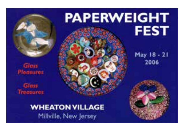
Paperweight Fest 2006