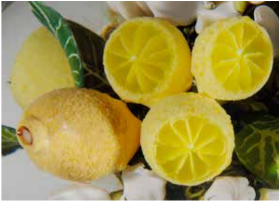
David Graeber lemons