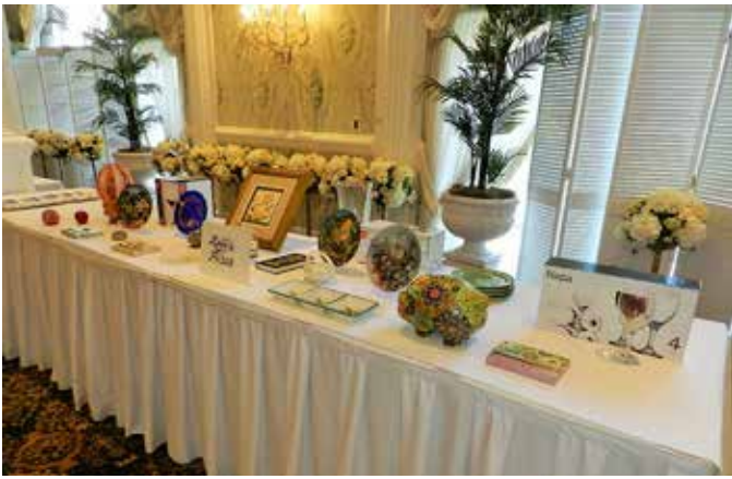
Another Fine Array of Raffle Prizes