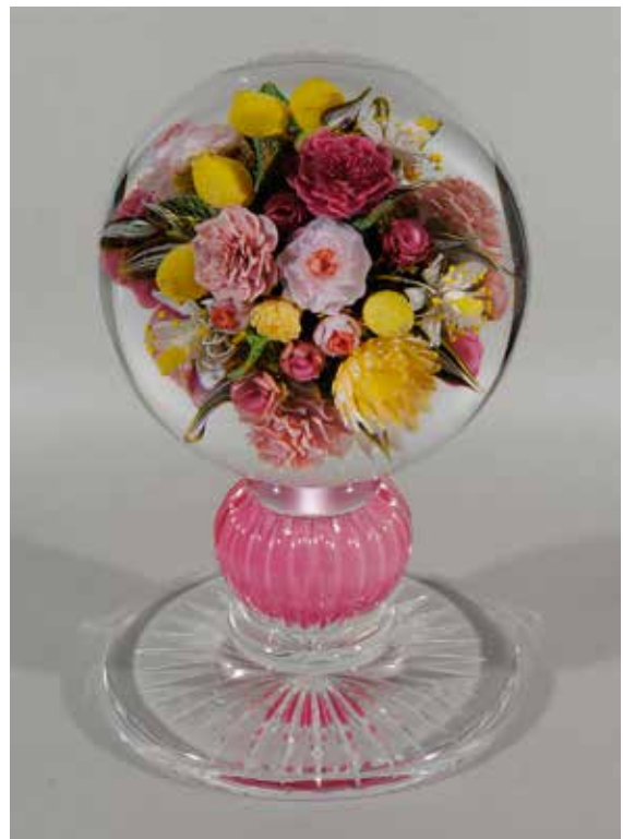
An Orb With an Attitude by David Graeber