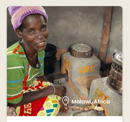
High Efficiency Wood Burning Cookstoves