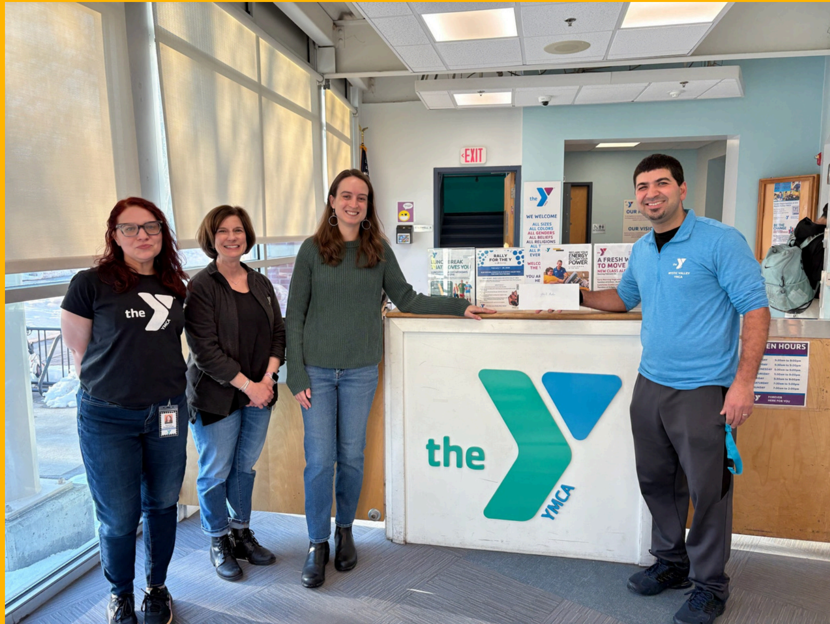
Mystic Valley YMCA