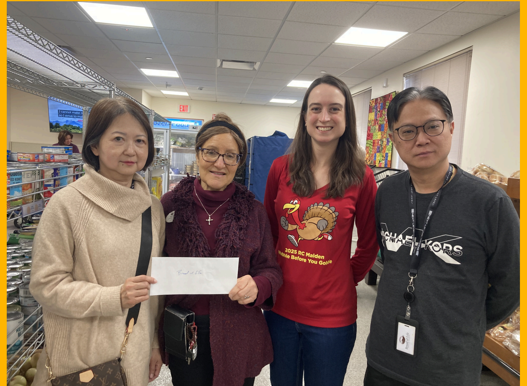
Bread of Life

Each charity received a donation of $3,500