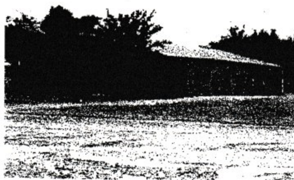
Bay City Hall, July, 2011