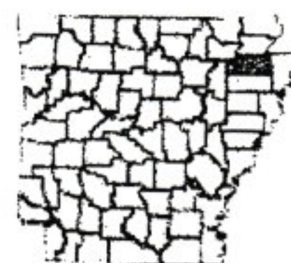
Location of Bay in Craighead County, Arkansas.

Coordinates: 35°44′43″N 90°33′46″W ﻿ / ﻿ 35.745278°N 90.562778°W ﻿ / 35.745278; -90.562778