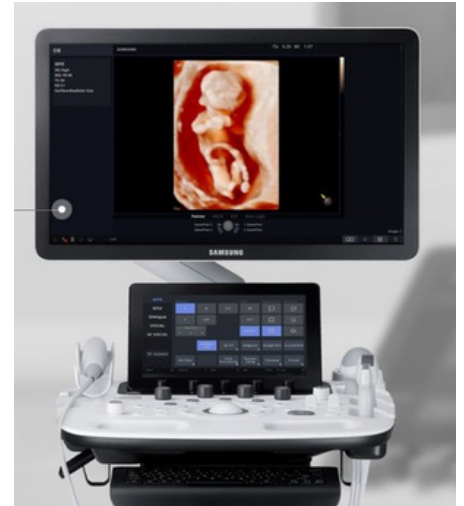
THE SAMSUNG HS40 ULTRASOUND IMAGING MACHINE GIVES OUR CLIENTS A GLIMPSE OF THE LIFE INSIDE THEM, LEADING TO A DISCUSSION ON FETAL DEVELOPMENT AND RESPECT FOR HUMAN LIFE.

Entering this exciting new phase of service comes with many expenses. We can't make this happen without your support. Please consider the financial request below which will help us rollout ultrasound in all three centers in 2022. Increased monthly funding will ensure we can continue to offer this service to our clients for years to come. To our current monthly donors, THANK YOU your generosity will help set us on a stable path of growth and opportunity in 2022. To become a monthly donor visit PCCFriends.org . Thank you!