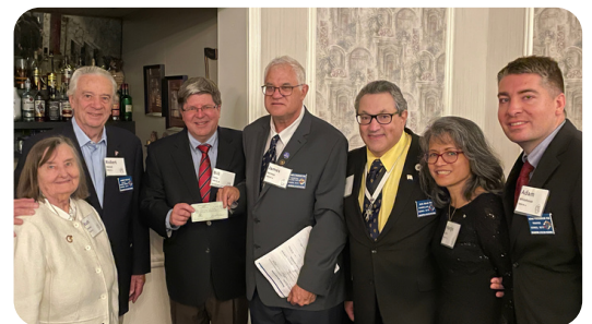
KNIGHTS OF COLUMBUS CHELMSFORD PRESENT A $1600 DONATION