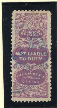
D15 DARK LILAC NON-DENOMINATED

The State Revenue Catalog by Dave Wrisley lists the stamp, with a note that it may have been used on Government, tax-free property exchanges. It is known used on deeds around 1910 to 1917.