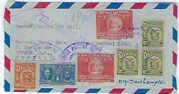
Figure 1: 50 centesimos on cover from 1940.

seeing other interesting covers related to the 1924 Arms Issue.