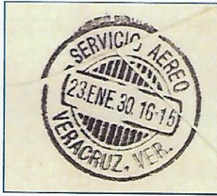
Fig. 18: Vera Cruz.

seeing other interesting covers related to the 1924 Arms Issue.