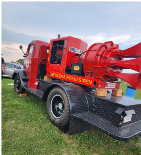
Back View of Truck