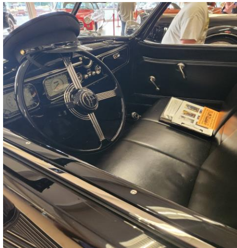
Interior of the Imperial