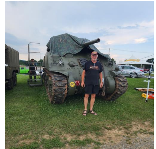
Sherman Tank – 1943 Chrysler Built

This year at Carlisle (July 11-13 th ) marked 100 years celebrating Chrysler. If you don't know about Carlisle, you are missing out. It's the World's largest Mopar-themed car show at the Carlisle Fairgrounds.