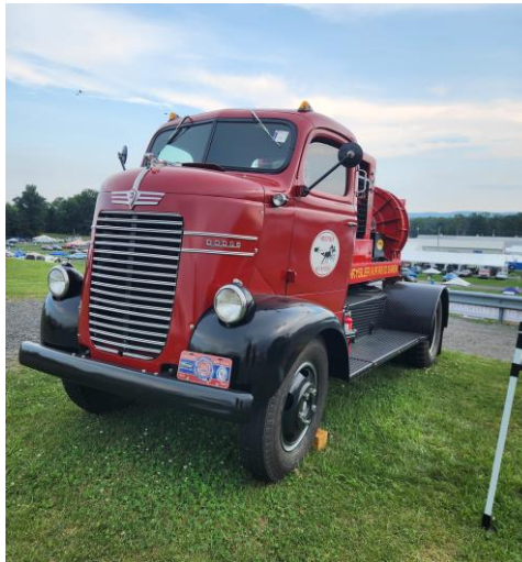
Dodge Air Raid Siren Truck