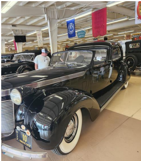
1937 Chrysler Imperial C-15