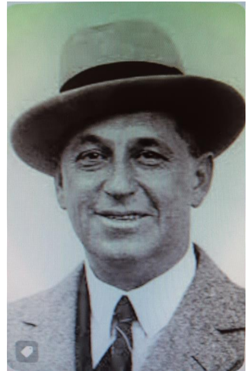
Walter P. Chrysler April 2, 1875-August 18, 1940

Walter P. Chrysler started his career working for train companies during the late 1800's and early 1900's. He worked for General Motors. After leaving G.M. he worked for Maxwell Motors. In 1925, he organized Maxwell and started Chrysler. In 1928, he purchased Dodge Brothers and renamed it Dodge. Also, Time magazine named him "Man of the Year." In 1967, he was inducted into the Automotive Hall of Fame.