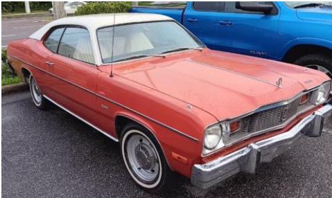
1976 Valiant Duster