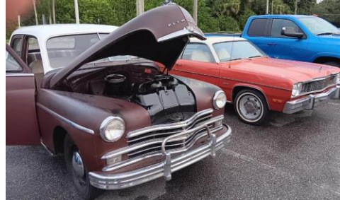
Both the Valient & Duster

They just recently purchased the car and are looking forward to joining others with the same interest that the older cars bring.