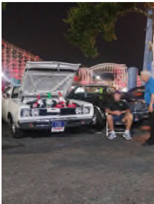
Factory air, 318 V8, 1968 Coronet 500