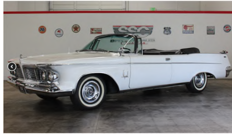
1962 Chrysler Imperial Crown Convertible