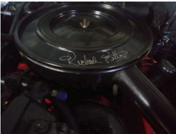
Richard Petty autographed air cleaner