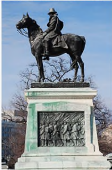
Ulysses S. Grant Memorial's central equestrian statue

If the horse has all four legs on the ground, the person died of natural causes, like President Grant did.