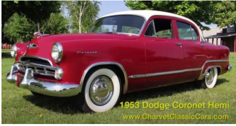
1953 Dodge Coronet Hemi

We love our Mopar HEMI rides. Few vehicles exist that are more exciting than the Dodge American muscle car. In 1953 the Dodge Hemi was born. The HEMIs are still popular, fast, and beautiful.