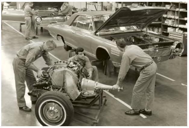
1963 Turbine engine installation

The fuel types used in turbine engines were wide and not well understood, and the engineers eventually realized the cars could run on anything such as leaded gasoline, diesel, jet fuel, kerosene, alcohol, and perfume. (And sometimes Whiskey!)