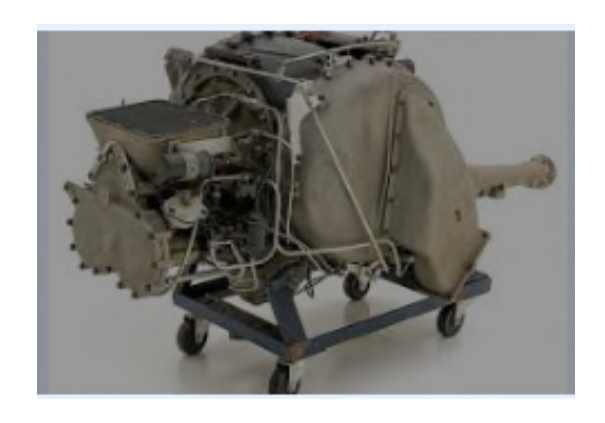
Typical version of the front drive Turbine Notice the transmission tail protruding