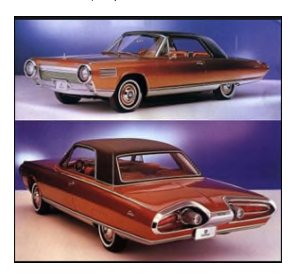
The first Chrysler Turbine car program began in 1954.