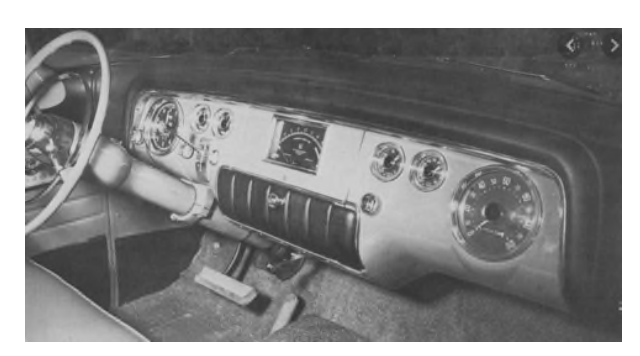
The clock is on the passenger side!

Fifty of the 1963 Chrysler cars were produced. They were leased to customers who would drive them for a year. They were all returned at the end of the lease.