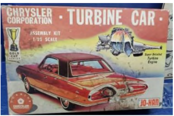
Original 1963 Chrysler Turbine Car Model.

(That's about $377,600 per engine in today's dollars!)