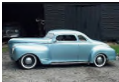
1941 Plymouth Business Coup