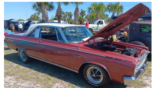
1965 Dodge Coronet 500 #'s Matching 383