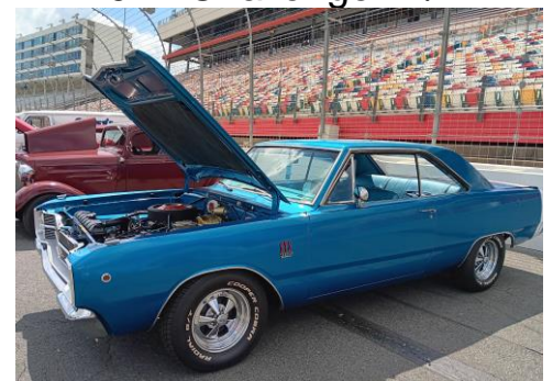
'68 Dodge Dart GTS 383