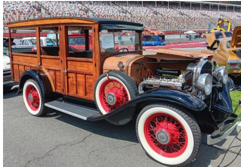
1931 DeSoto SA Six Woodie