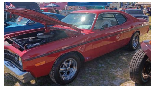
1974 Dodge Dart Sport