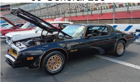
1977 Trans Am