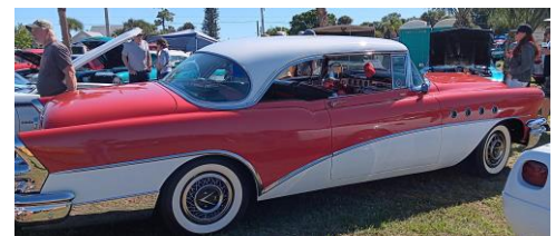
1955 Buick Roadmaster