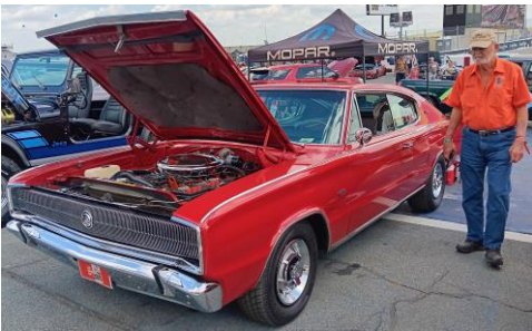
'66 Hemi Charger