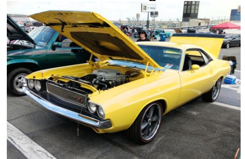
1971 Challenger R/T