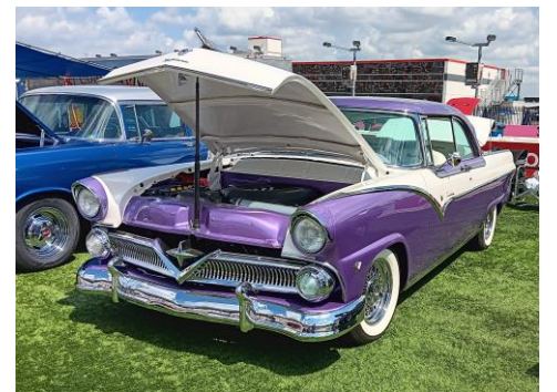
1955 Crown Victoria Ford