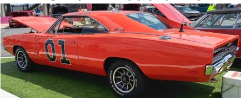
'69 General Lee