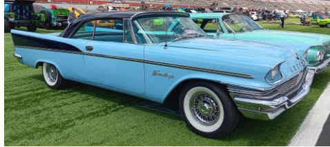
1957/58 Chrysler Saratoga