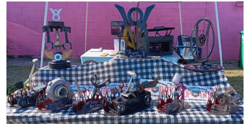
Trophies and Awards