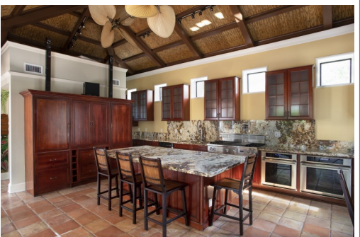
Built in 1999, Its uniqueness comes from the design of a home that surrounds the courtyard offering its owners an expansive private area. OFFERED AT $3,500,000 MLS #588692