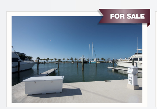
Slip #672 - 60' $415,000 MLS #579682

80' Slip Offered @ $650,000 Call Andy for Details 305-923-5753