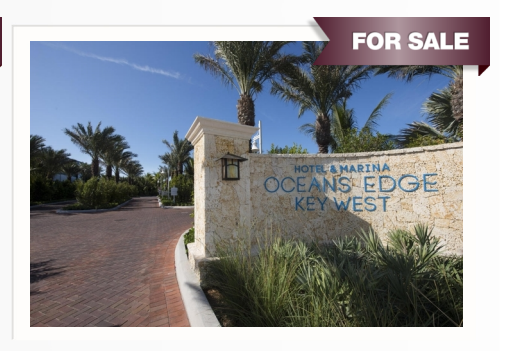
Slip #613 - 40' $262,000 MLS #575822