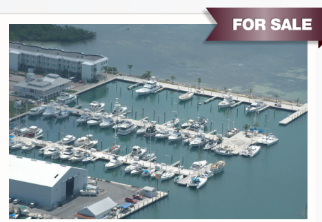
Slip #643 - 50' $315,000 MLS #587899