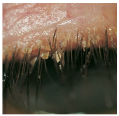
MGD (left) and anterior blepharitis (right).