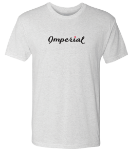
SMALL CENTER CHEST: SCC AVG SIZING 7.5" W