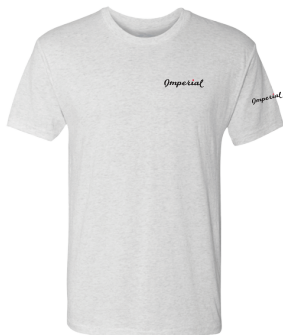
LEFT SLEEVE: 1LS AVG SIZING 1.5 - 2.5" W (1" above cuff)