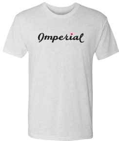
FULL CHEST: FC AVG SIZING 12.5" W