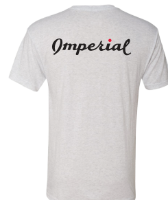
FULL BACK: FB AVG SIZING 12.5" W