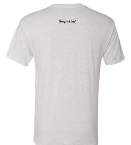
SMALL UPPER BACK: SUB AVG SIZING 3-3.5" W