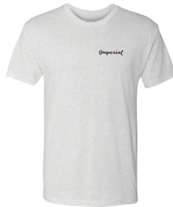
LEFT CHEST: LC AVG SIZING 3-3.5" W