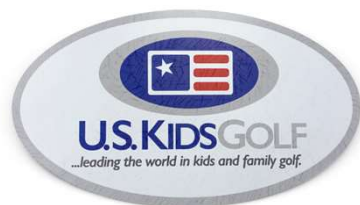
Oval Brand Sign 8.75 and 13.4