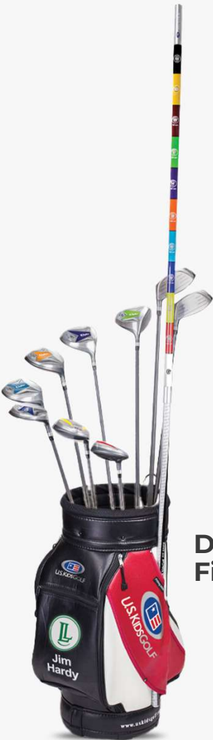
Den Caddie Fitting Center