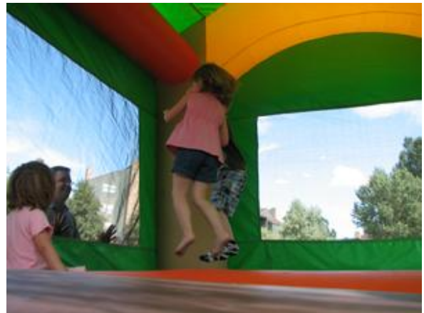
The kids were jumping for joy in the Bouncy Room

For those of you who couldn't make this year's AG summer picnic, on this page and the next are a few pictures to show all the fun you missed. Hope you can make it next year! ~