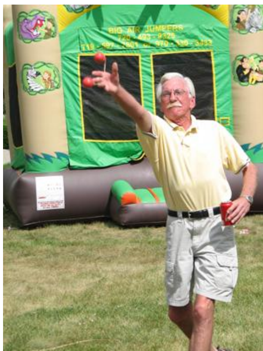
...so the Pro had to show 'em how it's done!