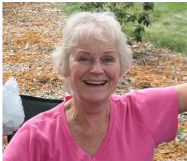
A happy winner of one of the door prizes