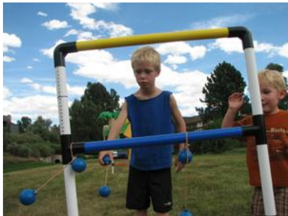
The ball toss game was a challenge for some...

Pictures from the Picnic continued from page 1