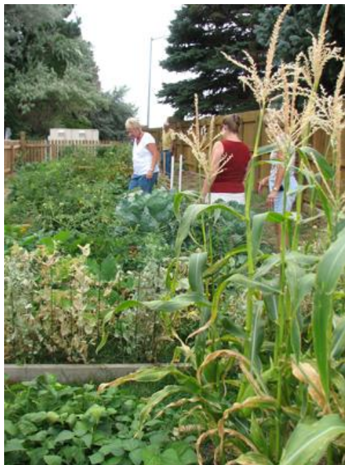
Others enjoyed a tour of the community garden