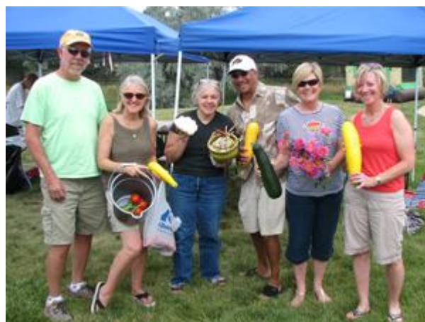
The Gardeners display their bounty