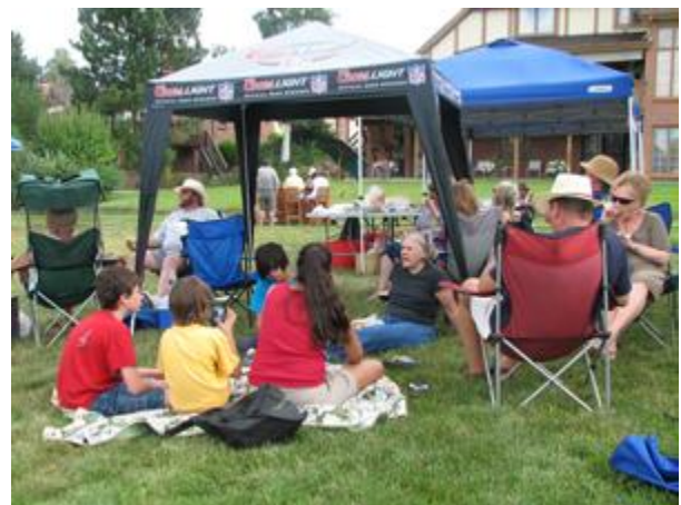
A good turnout overall with lots of good food and great conversation