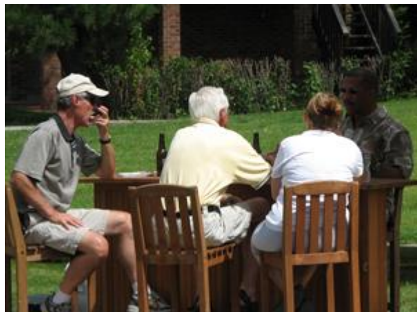
The bar was popular hangout for many...