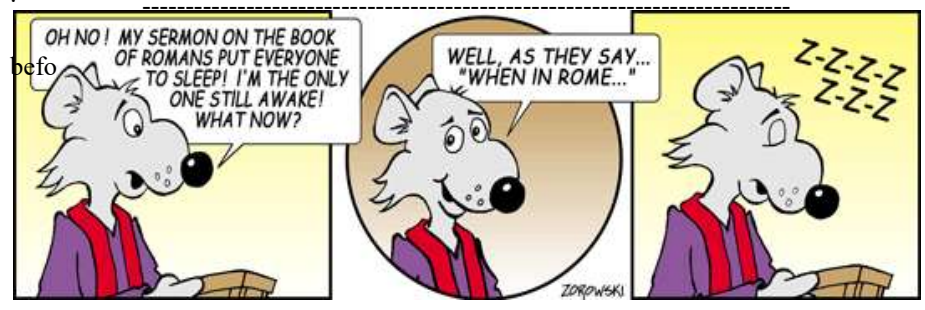
used with permission

We ask God to bless them in their parochial life and the work they do in their local community. We ask you to pray each day that God would bless and increase their work of evangelism and Christian sharing.