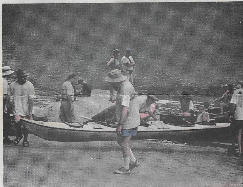
Canoers arrived at intervals for lunch at Cedar Creek Park last Friday.