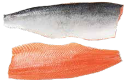
Salmon Fillet Skin On