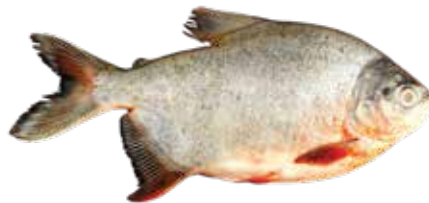
Red Pomfret Whole Round