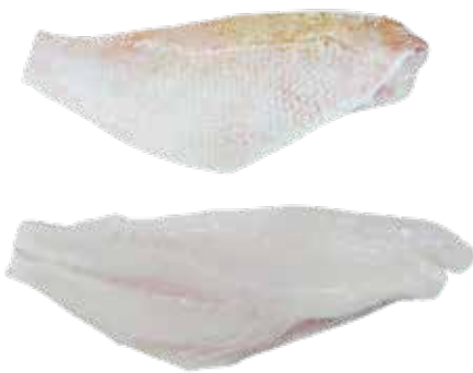
Red Snapper Fillet Skin On