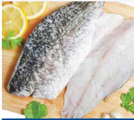
Barramundi Fillet Skin On