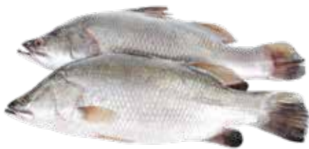
Barramundi Whole Round