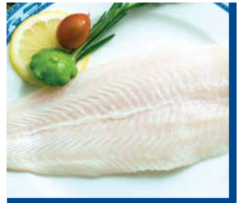
Pangasius Fillet, Well-trimmed