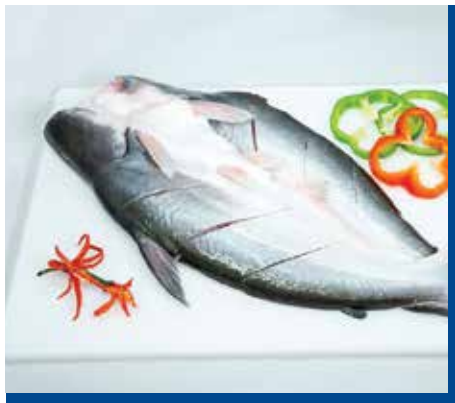
Pangasius Butterfly, Headless / Head on