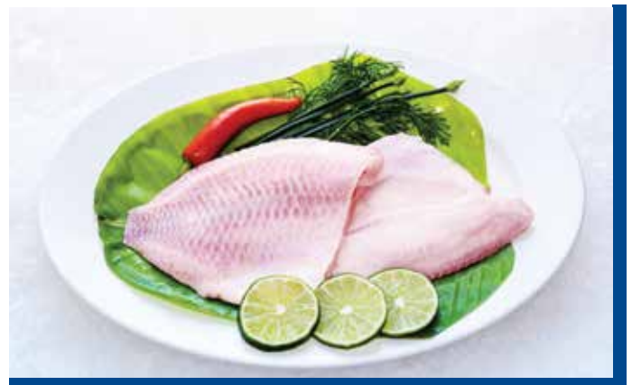
Red Tilapia Fillet - Skin On