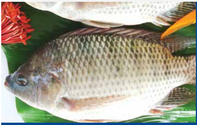
Black Tilapia Whole Round & GGS