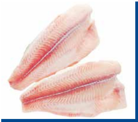
Pangasius Fillet, Un-trimmed