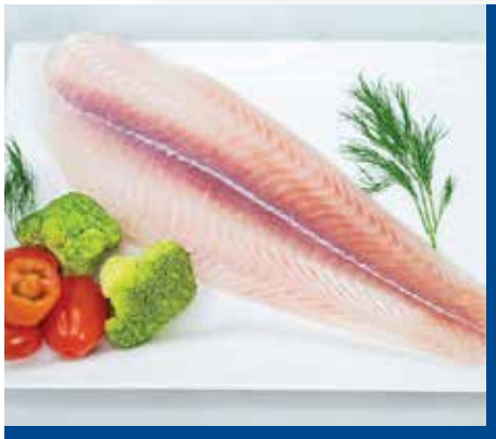
Pangasius Fillet, Semi-trimmed