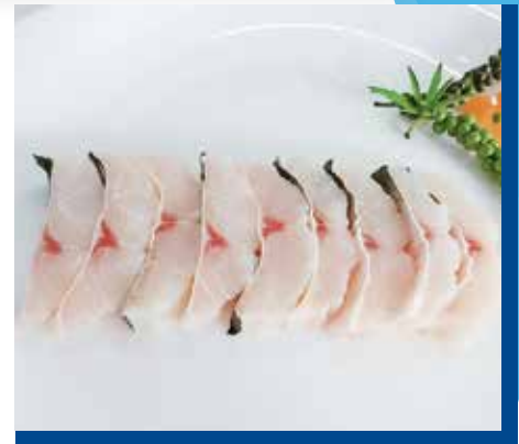
Pangasius Slice Cut