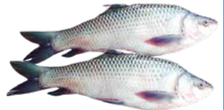
Rohu Whole Round