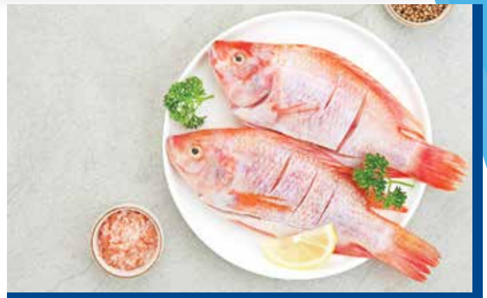
Red Tilapia Whole Round & GGS