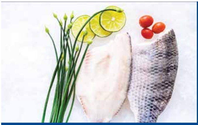
Black Tilapia Fillet - Skin On