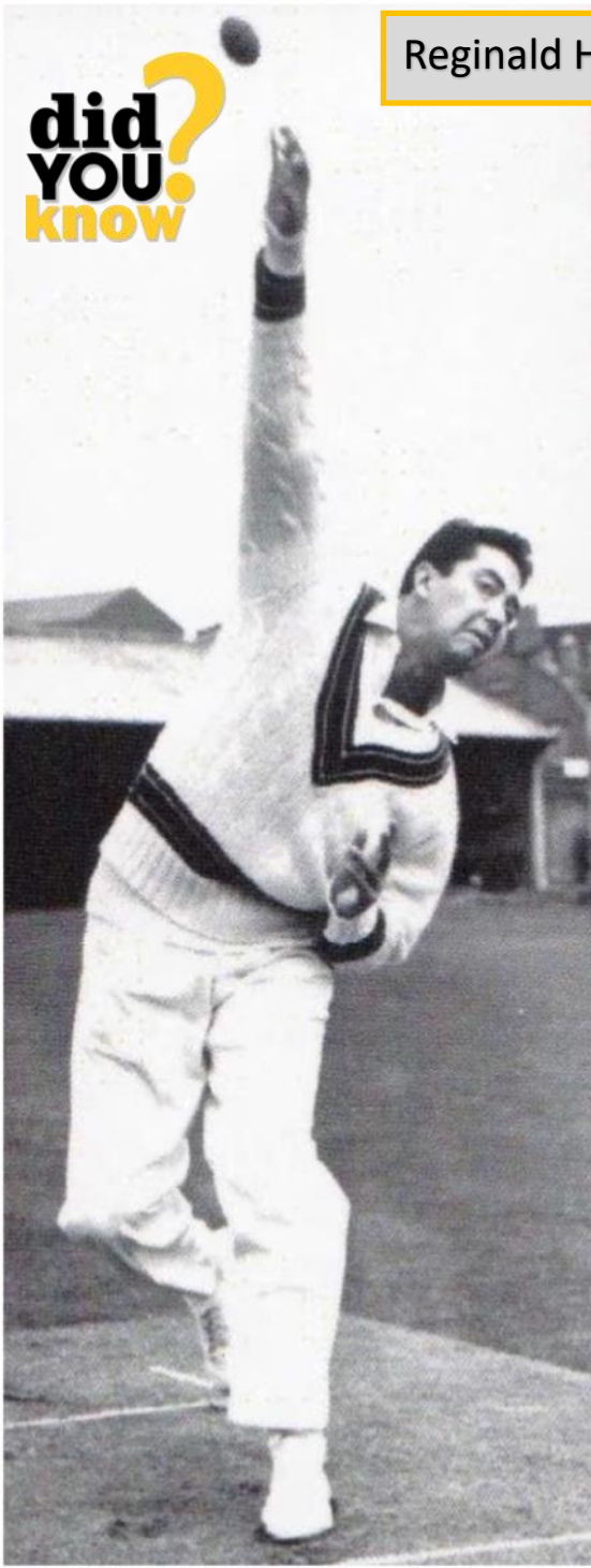
Australian test cricketer Rex Sellers, pictured practising his leg-spin bowling.